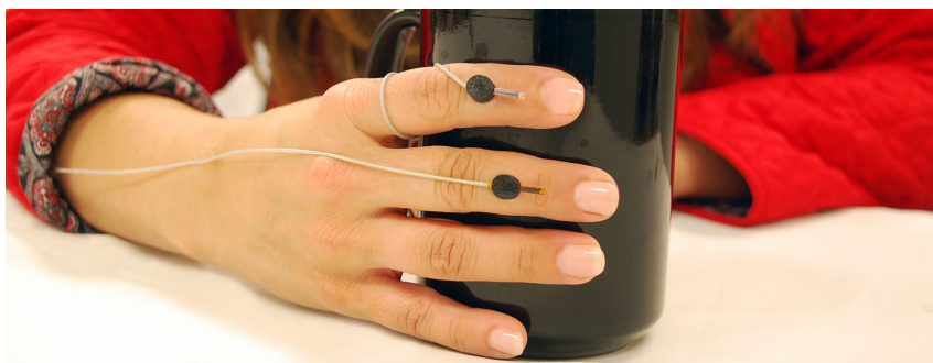
THE STANDARD AND EXTRA FLEX CABLES FOR MICRO SENSOR 1.8, SHOWN ON HAND

THIS DRAWING FOR REFERENCE ONLY. NOT FOR SPECIFICATION OR TOLERANCE PURPOSES.